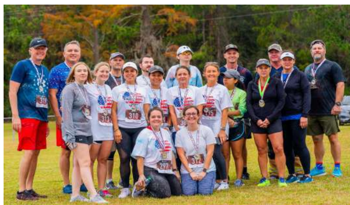
Congratulations to the WINNERS of the 2023 Veterans Day Red, White & Blue Color Run!! Thank you to the Waycross-Ware County Airport for hosting us.