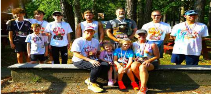
Congratulations to the WINNERS of the Okefenokee Color Run 2024!!