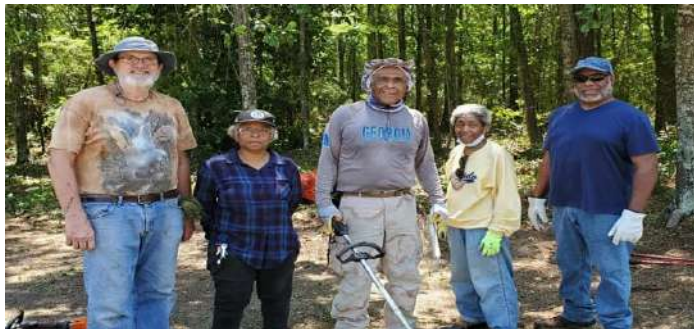
Red Hill Cemetery Clean-up Day, Every 2nd Saturday 9AM