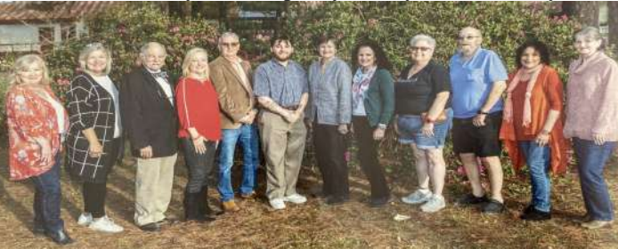
Ware County Bicentennial Committee 2024

Special Thanks to: Memorial Satilla Health