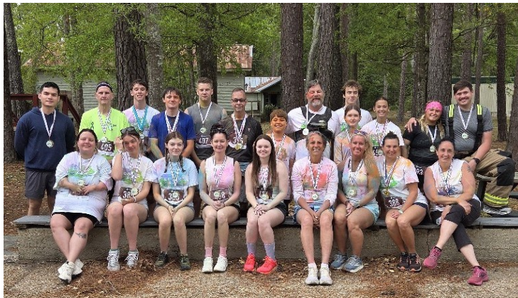
10th Annual Okefenokee Color Run Winners ~ 2025