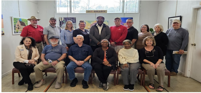
OHC Board of Trustees ~ 2025