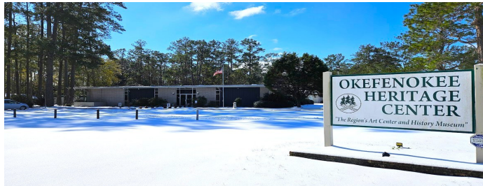
Snow at OHC ~ Jan 2025