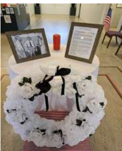
Pres. Jimmy Carter Memorial