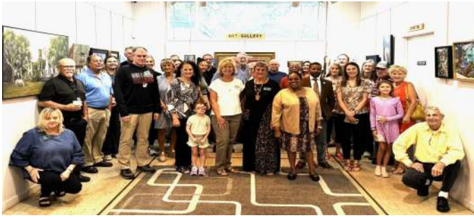
Chamber of Commerce Rise & Shine at OHC ~ Oct '24