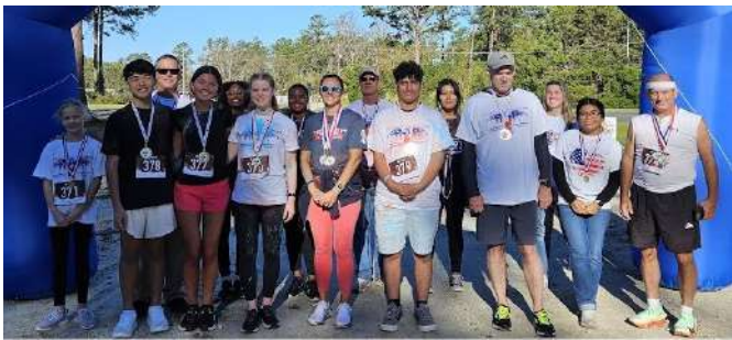
Veterans Day Red, White & Blue Color Run Nov '24